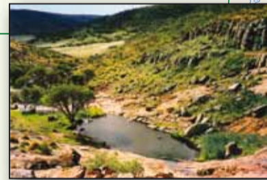
Gawler Ranges