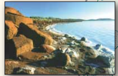
Lake Gairdner

visit our web site www.wudinna.sa.gov.au or Ask a local