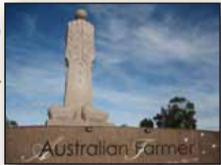
"The Australian Farmer" Granite Sculpture - Wudinna

Gawler Ranges National Park The majority of tracks within the park are recommended for high clearance 4WD vehicles only. All tracks and roads can quickly become impassable in wet conditions. No services are available within the park. Visitors must carry own fuel, water etc. Pets are not permitted in the park. Campfires are permitted in designated areas outside of Fire Danger Season. Firewood may not be collected from within the park.